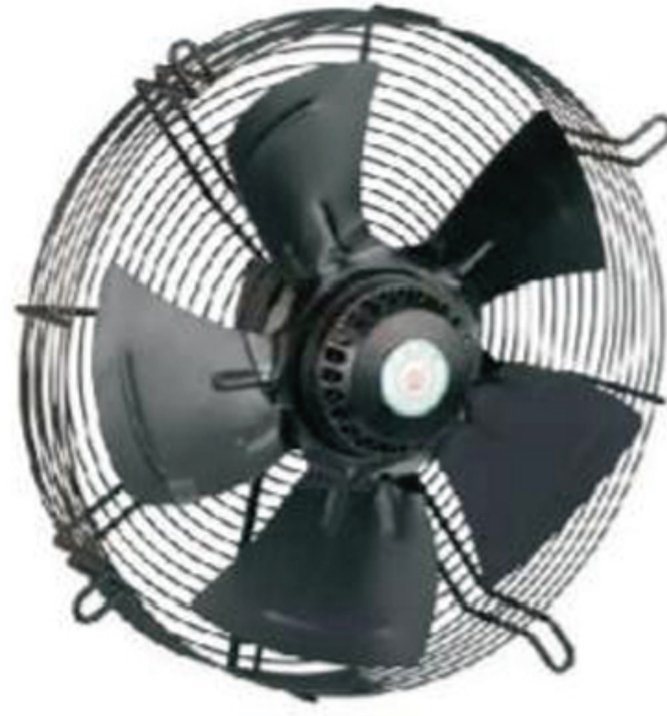
网罩 Grid (S) K-AC-350-S220-**