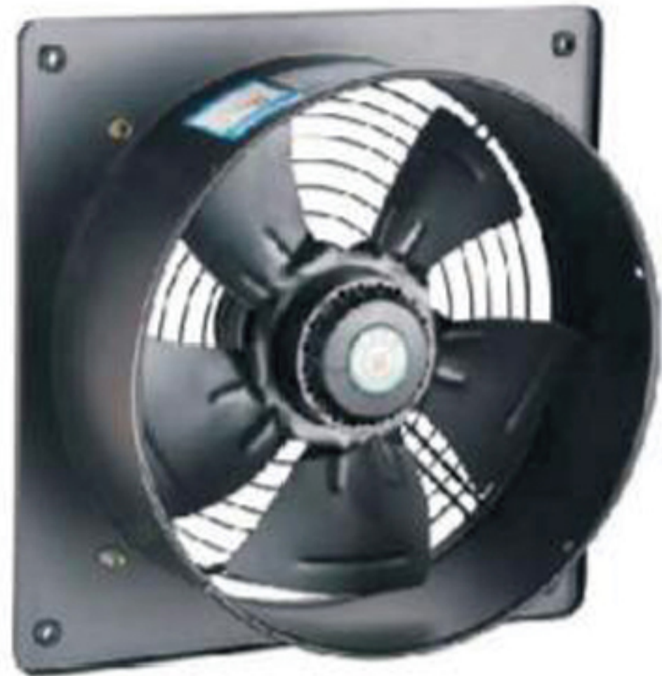
方形 Square (W) K-AC-350-W220-**