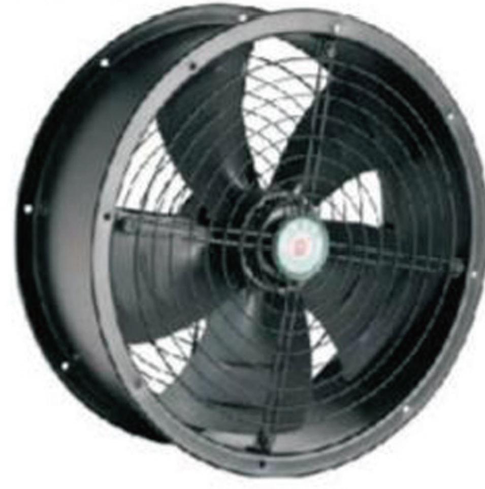
圆筒 Cylinder (Y) K-AC-350-Y220-**